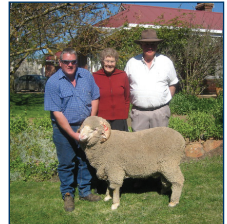
Top Priced Sale Ram 2009 $2800 to A. Day & Son for a 12 month old sire by Henry 1, Micron 18.4, Comfort Factor 99.4, Live Weight 80kg.