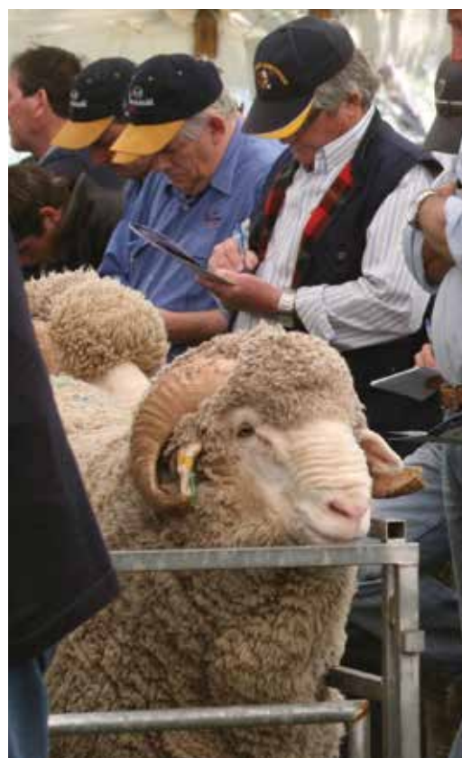
Sale in progress

We thank all buyers and under bidders for their support at the 2012 sale.