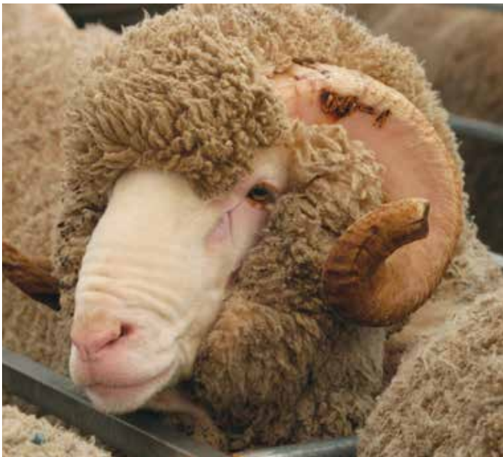
One Oak No. 2 "Tomahawk" purchased by Grogansworth Merino Stud for $15,000 Sept. 2012. Micron 19.5, CV 13.8, SD 2.7, CF 99.8

He was bred by ET from a One Oak No 2 stud ewe and sired by 'Kaldoonera', the Australian Hogget Ram of the Year 2010 (Hay Sheep Show) from White River stud, South Australia.