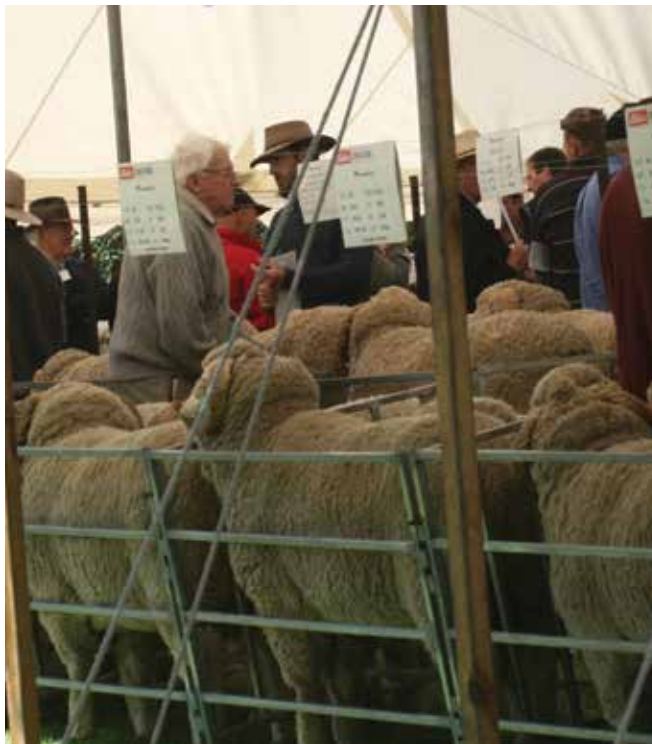
View of 2012 Sale proceedings