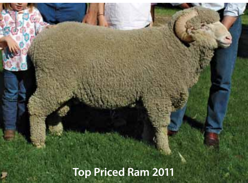
Top Priced Ram 2011

Monday 22 October 2012 at 3.00pm Inspections from 11.00am